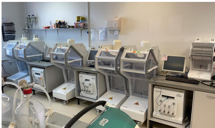
50L SU CellMaker bioreactors in a bacteriophage production lab

Every development process in an innovative biotechnology or biopharmaceutical plant has an identical goal: to bring a new bio-based product to market while taking into account acceptable costs and maximizing profits. One of the biggest sources of the cost of goods is the production process itself, and therefore also the type of technology used in this process. Traditional bioproduction plants rely on stainless steel (SS) fermenters with large capacities (20000L or more) and related downstream processing equipment. In the mid-2000s,